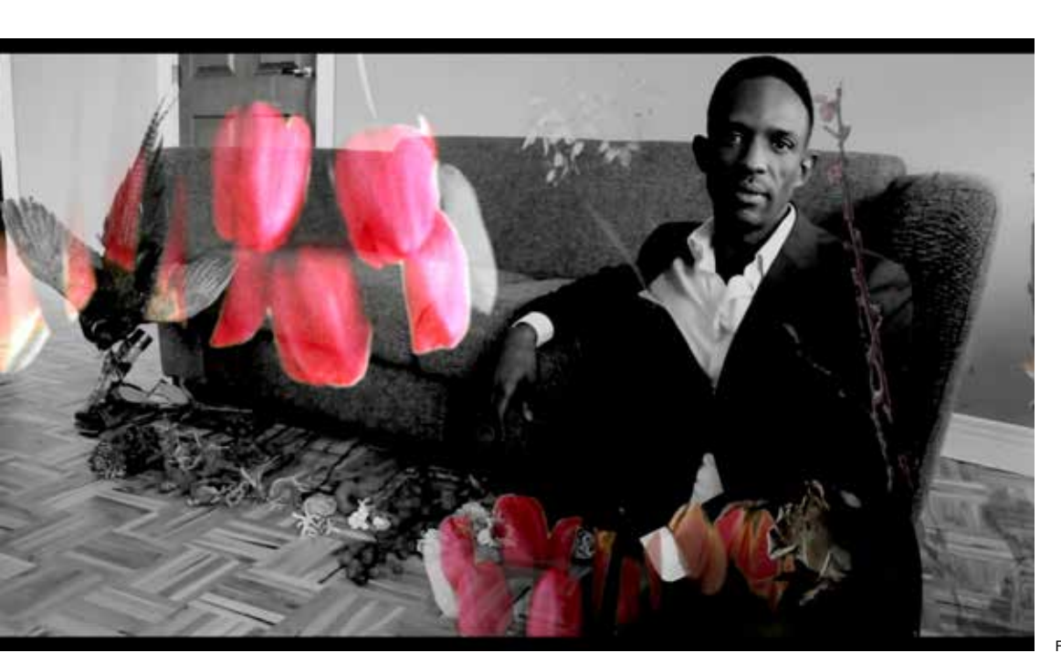
Figure 6. Still from movt nr. 8: The Quality of 21 (2016).

The text Baldwin speaks in the film is quite well known. He explains to the interviewer that "niggers" are the invention of white people and that such an invention reflects on those same white people. Landvreugd's changes—bleeping the word nigger while simultaneously flashing "**gg**" on the screen—claims Baldwin as someone more open about his homosexuality than he in fact was. It also emphasizes the presence of both race and sexuality in Landvreugd's oeuvre. While he states that his previous work focused on race to the exclusion of sexuality. I argue that a gueer aesthetic has consistently been present. Similarly, with Lobi Singi, Landvreugd seems to be focusing on sexuality, but the deliberate choice of interracial sex acts with black "tops," and of course the use of James Baldwin's voice and text, mean that race is also very present. The film's lack of subtlety is one of the reasons that it is the least strong of the works examined here. So much of Landvreugd's other work is precise and polished; in contrast, the details of Lobi Singi seem uneven and rushed. The unnecessary self-censorship of "faggot" to "**gg**" and the sometimes too-easy use of visual text do not stand up to the images and audio that Landvreugd chose. Nevertheless, the video marks an important shift in his work.