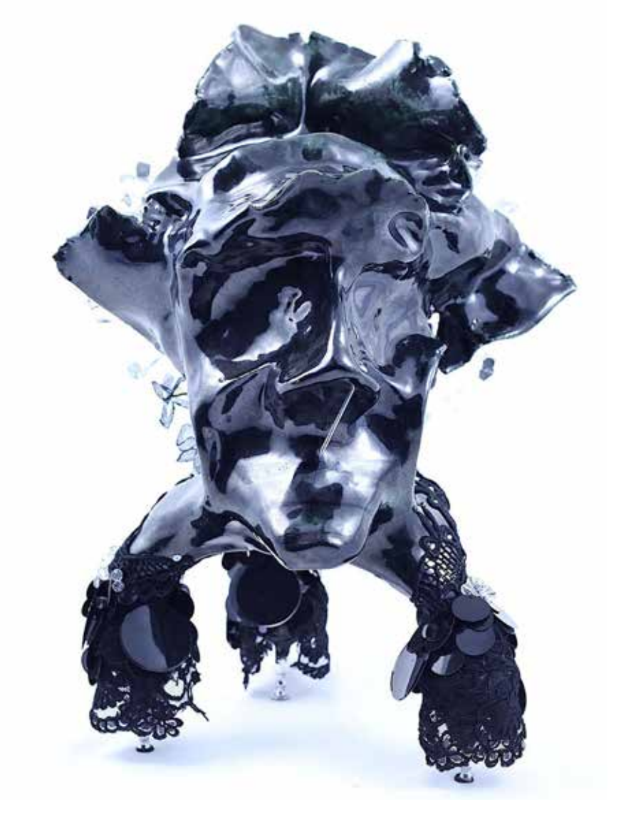
Figure 3. movt nr.1: Anaruka 5 (2010), Lava, Ceramic, Swarovski, Beads, Sequence, Lace, Fellt, Ribbon, Hair, Nails, Paper, Gold leaf,

Landvreugg's other major body of work to date, the Anarusha series, also engages unexpected images of blackness. The sculptures, named simply Anaruka 1, Anaruka 2, and so on, challenge stereotypes by facing head-on, gesturing simultaneously toward the past and toward the future. The Anarukas – all made of ceramic covered in black enamel, all adorned with elements such as hair, lace, crystals, sequins, and glass-are figurative but not exactly human. The faces are melted; with no discernible eyes or mouth, they seem disfigured, grotesque. The adornment is also nontraditional: hair often surrounds the base of a bust, while lace might protrude out of the back of the head. These sculptures address the stereotypes of blackness as frightening, even evil, but they do so in a seductive way. The shininess of the enamel, the near-liquid quality of the material, along with the beauty of the adornment, compel you to look, even though the figure as a whole might be repellent. While the existing writing about these pieces has focused on the front and side views of these