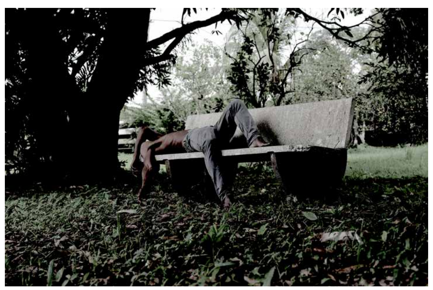
Figure 7. movt nr. 8: Uitkijk (2015).

Created and exhibited in 2015 in Suriname, movt nr. 8: Robby also demonstrates a shift away from race—here, toward interiority. While the Anarusha sculptures and the Atlantic Transformerz series presented different possibilities for the black subject, they also focused on spectacle. Robby , however, shifts to a portrayal of the black man with everyday objects—and even such objects on their own—portraying spaces that are both domestically and emotionally interior. The installation consists of a mirror and five framed photographs hung together. From afar, they make a tableau that could exist in many homes. But a closer look reveals that the installation is not so normal. The mirror is hung too high for the average person to see themselves. Some of the images are crisp, while others are blurry; one is rotated ninety degrees, and another is hung upside down. One image portrays the artist on an outside bench, in a position that could be despair or repose; another shows the artist, pensive, standing in a ramshackle building that is open to the natural world. Robby illustrates Landvreugd's concept of blackness as fact by emphasizing that blackness both is